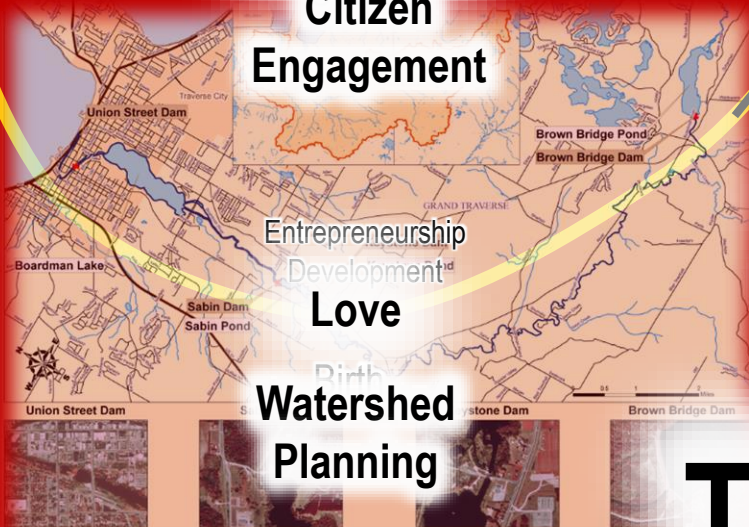
THE BOARDMAN RIVER DAMS STUDY