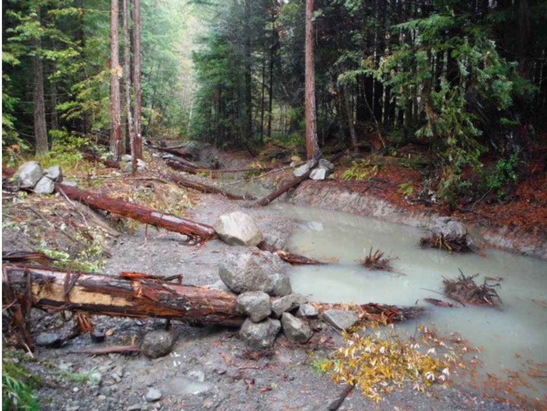
Photo Caption: Restored habitat for salmon as part of the second phase of this project in Lawrence Creek, California. Similar work will be done in Phase 3 to further enhance connectivity on Lawrence Creek with support from the California Fish Passage Forum.