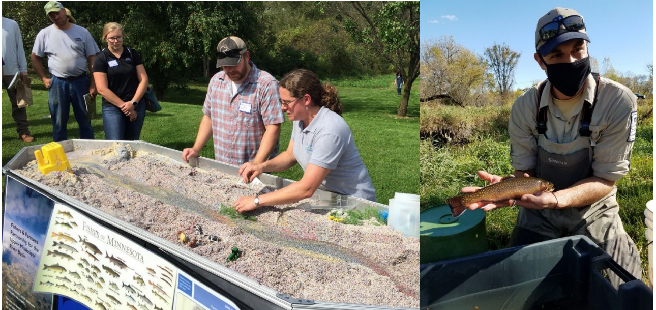
Photo Caption: Fishers and Farmers Partnership working with Ag Drainage Management Coalition at a Clean River Partners Field Day in Minnesota (left). Native Brook Trout caught by Minnesota Department of Natural Resources from Rice Creek, Minnesota (right).