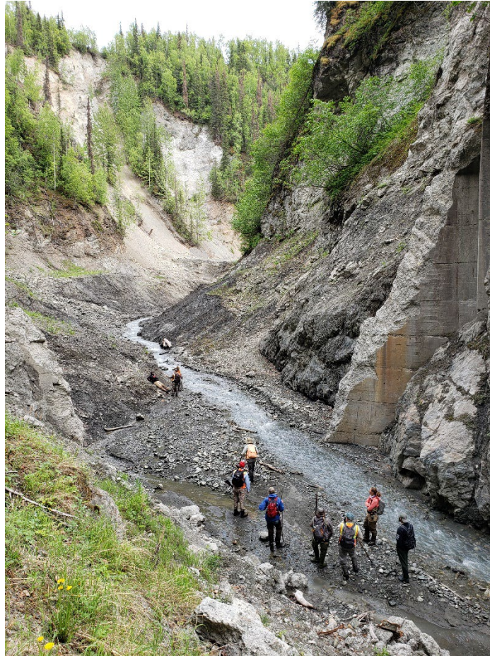
Photo Caption: Site of the historic removal of the lower Eklutna dam on the Eklutna River, Alaska in the Matanuska Susitna Basin Salmon Habitat Partnership.

Project Description: The lower Eklutna Hydroelectric dam, built in 1929, blocked the migration of spawning salmon and was the first of two severe impacts to the Eklutna River system by hydroelectric projects and was abandoned when the second project was built upstream, diverting the entire flow of water. Over the course of 2017 and 2018, the defunct lower Eklutna dam was successfully removed in the most ambitious river restoration project ever attempted in Alaska. With support from the Matanuska Susitna Basin Salmon Habitat Partnership , the Conservation Fund, the Native Village of Eklutna and Eklutna Inc. completed the 5- year, $7.5 million effort to remove the lower Eklutna River dam. Known to its ancestral inhabitants as Idlughet, this area is among the traditional lands of the Eklutna Dena’ina who would overwinter along the shores of Eklutna Lake (Idlu Bena). The Eklutna River, Idlughentnu, and its wild salmon runs have long supported the Eklutna Dena’ina, however historic hydroelectric development on the river has greatly diminished the formerly flourishing salmon fisheries. The completion of this project will open up access to the necessary habitats for salmon in the region.