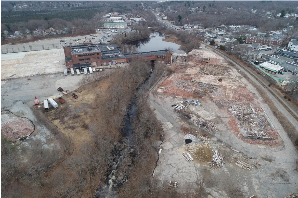
Photo Caption: Aerial view of the Armstrong Dam and project site in Braintree, MA within the Atlantic Coastal Fish Habitat Partnership.

Project Description: For many years, the former mill industry along the Monaquot River in Massachusetts impacted historic herring runs and disconnected species from their spawning grounds. Now the Armstrong Dam is the primary barrier to fish passage on the river. The dam no longer serves its original purpose and is also a public safety hazard. This project, led by the Town of Braintree in the Atlantic Coastal Fish Habitat Partnership , will remove the Armstrong Dam. There is also a concurrent project to remove the downstream Ames Pond Dam and install a pool-and-weir fishway around Rock Falls. When these projects are completed, 36 miles of unimpeded upstream access to 180 acres of river herring spawning habitat will be restored. This project will provide river herring access to spawning grounds, which have been blocked for centuries by dams. The subsequent increase in these forage fish should benefit recreational fish species such as striped bass and bluefish. The removal of the dam will also improve public safety by removing a flooding hazard.