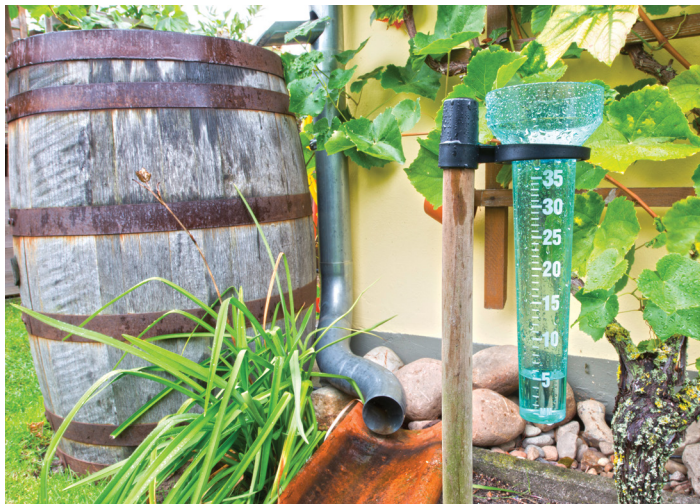
Figure 1: LWI Rain Barrel

Drinking water utilities can leverage LWI from each of these categories to meet water supply and quality needs. Water use efficiency solutions such as: indoor, high-efficiency appliances and fixtures; turf replacement and water-wise landscapes; smart irrigation controllers; and customer-side leak detection devices make it possible for utilities to treat conservation as a source of supply. Advanced onsite reuse systems, greywater systems, and rainwater harvesting provide alternative sources of water supplies by offsetting potable water use. Source watershed green infrastructure strategies — such as conservation easements, revegetation, riparian buffers, and wetlands restoration and creation — can be used to protect drinking water quality.