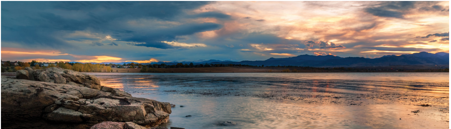
Figures 6: Westminster, Colorado

There are several ways local governments can adopt new regulations to prescribe or incentivize LWI implementation. They can establish rules related to new development or redevelopment as a cost-effective approach. This can range from prioritizing GI for onsite, stormwater management in post-construction stormwater ordinances (as is done in Seattle, Washington, and Eugene, Oregon); to establishing conservation-oriented tap fees designed to promote water-wise growth in the arid West (as is done in Westminster and Castle Rock, Colorado); to adopting an ordinance requiring new development to reuse available greywater, rainwater, and foundation drainage for toilet and urinal flushing and irrigation (as is done in San Francisco, California). Local “net zero” water policies, which allow for new development so long as there is no net increase in water consumption, are another tool cities have used to advance LWI.