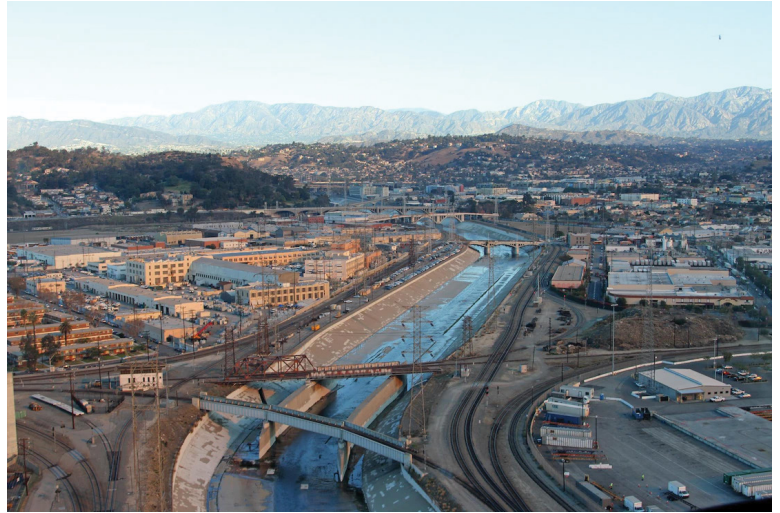
Figures 3 & 4: LA Stormwater Infrastructure