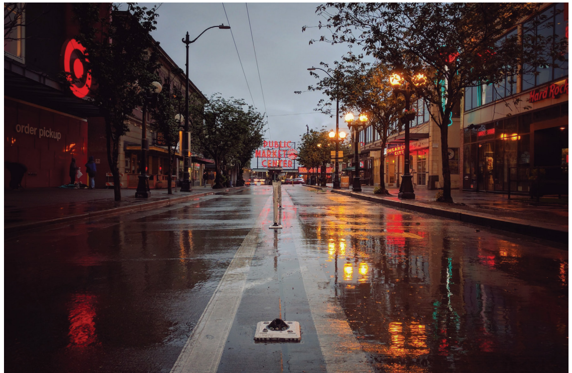
Figure 2: Seattle Stormwater

To use municipal bonds to finance LWI, however, local governments must first navigate accounting, legal, and tax constraints. Accounting rules on debt are, in fact, sufficiently flexible to enable utilities and municipalities to capitalize investments in localized infrastructure of all kinds. A small but important set of water utilities are finding that they can invest municipal bond proceeds in LWI and comply with the Governmental Accounting Standards Board (GASB) Concepts Statement No. 4’s requirement that the agency “control” the asset to be financed by entering into property liens or contracts with property owners. GASB has also promulgated an alternative to Statement No. 4. More than ten years ago, GASB issued Statement No. 62 codifying “Regulated Operations” accounting, providing that local governments may capitalize spending “business-type activities,” such as consumer incentives to implement LWI, as long as they effectively commit to repaying their investors. In addition, local governments must also have the requisite legal authority to issue debt to finance LWI. As with accounting guidelines, many of these legal requirements are sufficiently flexible to allow for, and are not complete bars to, bond financing LWI. Within existing flexibilities of the federal tax code, local governments are likely able to access tax-exempt governmental bonds to finance LWI, keeping these offerings attractive to investors.