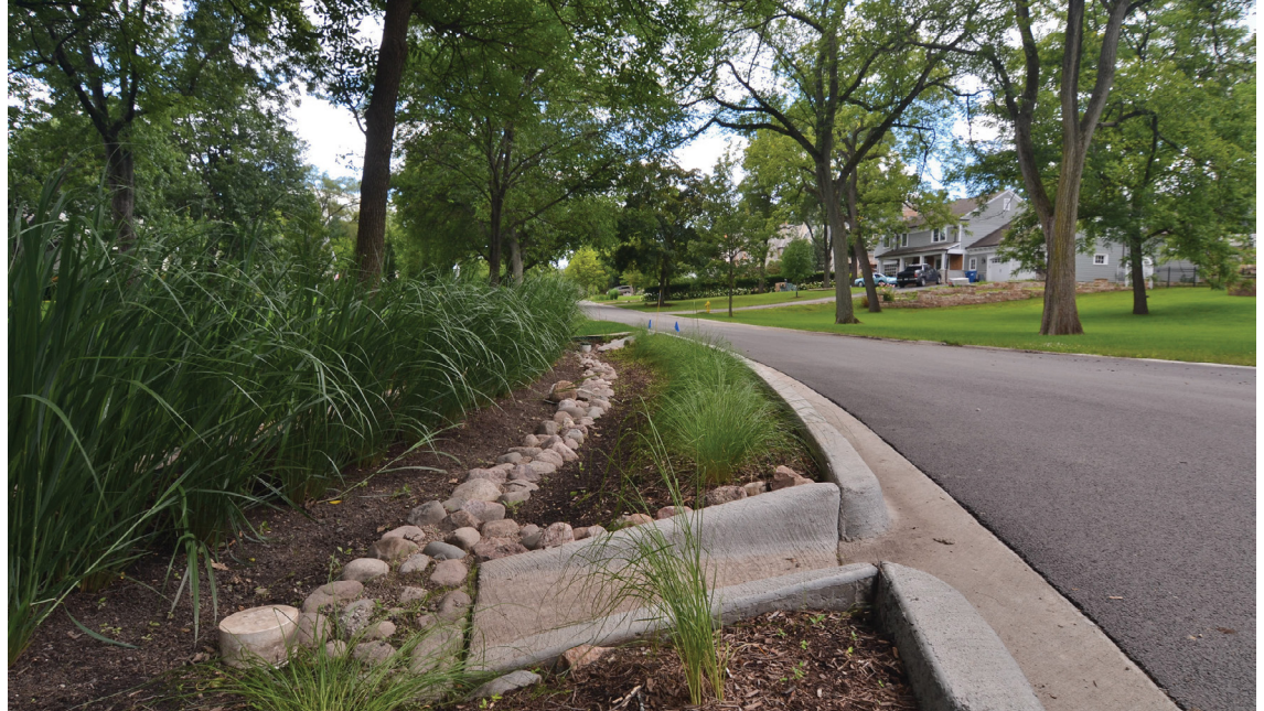
Figures 5: Moulton Nigel

Water utilities are already demonstrating how development and implementation of alternative business models has allowed them to encourage water conservation and efficiency and better weather drought, while still maintaining revenue stability. As more water utilities demonstrate the long-term benefits of alternative business models that do not rely on selling water as a commodity, we expect that there will be greater opportunities to increase adoption of LWI.